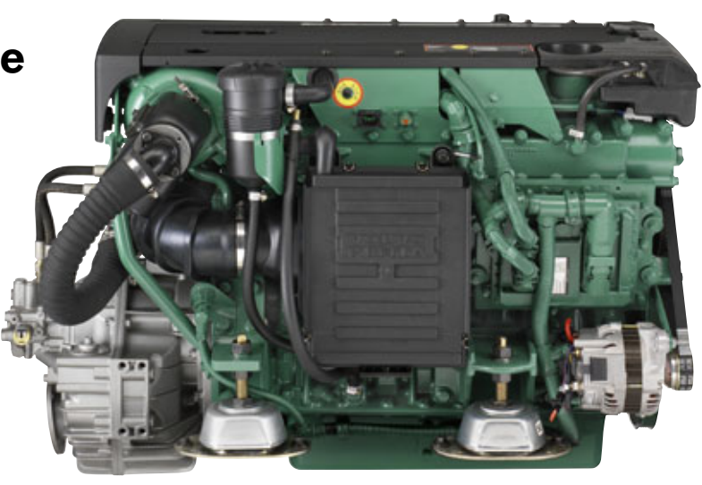
D4-260 with HS63AE reverse gear

EVC makes boating easier and safer, offering twin engine synchronization. EVC is scalable from one station up to four, from a classic dashboard up to an advanced driver